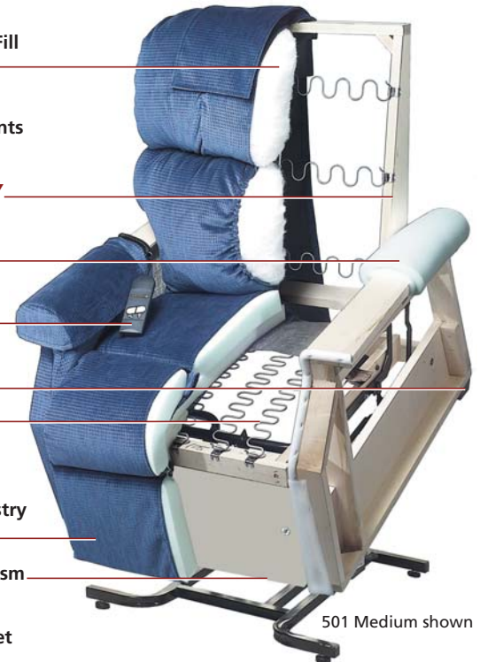
501 Medium shown

Adjustable Anti-Skid/Scrape Feet STABILITY & SUPPORT